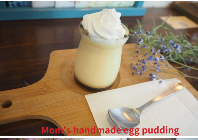
Mom's handmade egg pudding