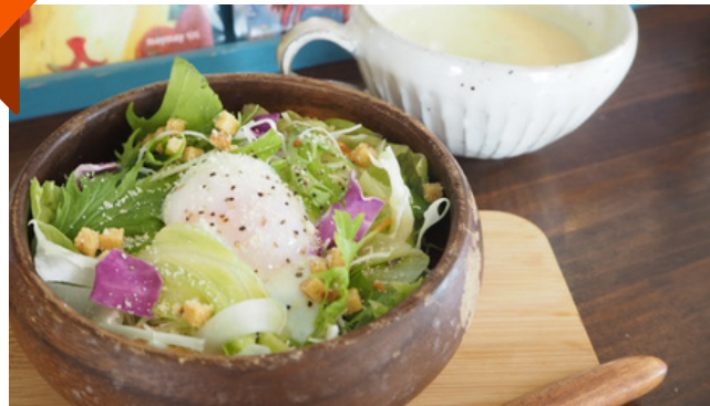
KIDS PLATE ¥680

Egg sandwich + yogurt + drink (Please choose from orange, milk, soy milk)